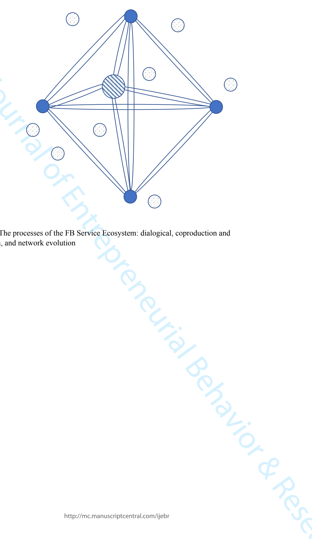
Figure 3: The processes of the FB Service Ecosystem: dialogical, coproduction and cocreation, and network evolution