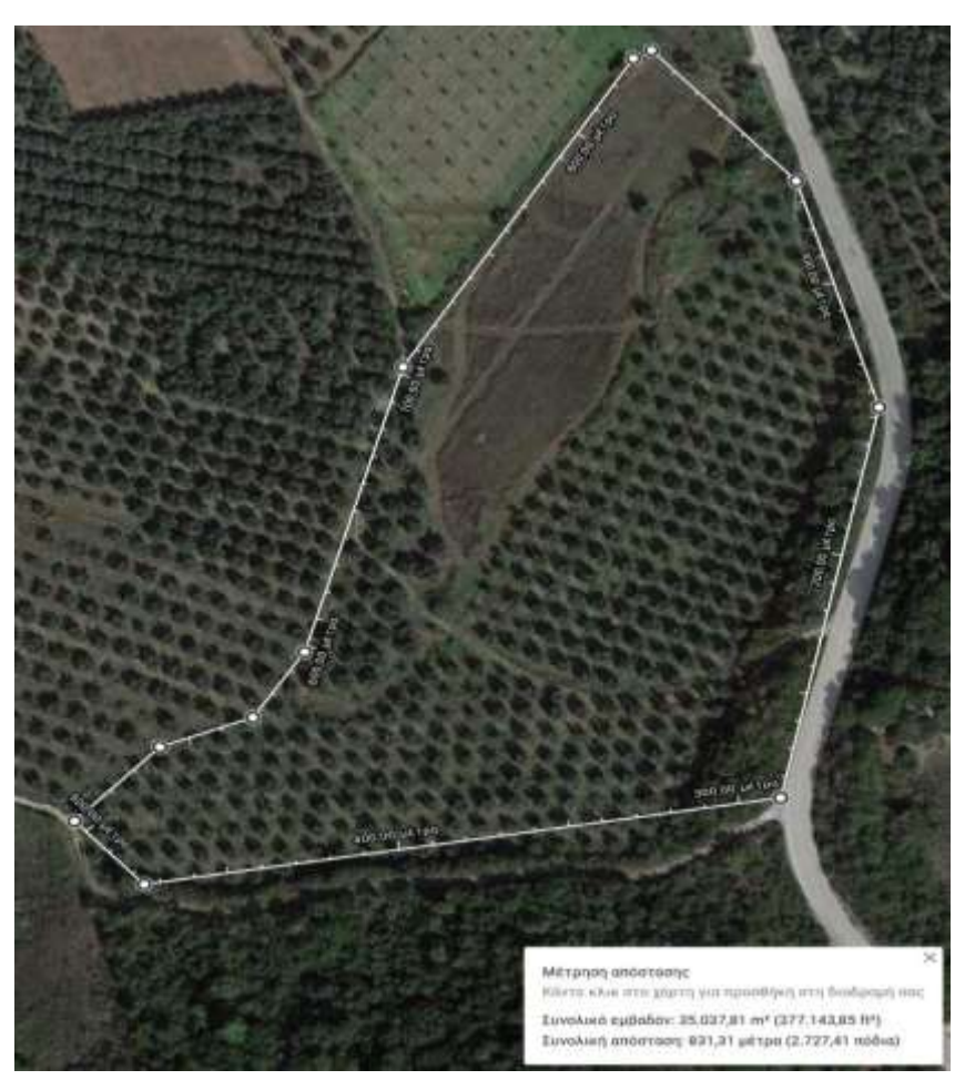
Figure 1. The farm in which FINT demonstrated IoT and traceability integration through IoF2020 collaboration

The area cultivates fifty per cent (50%) of the famous and protected "Kalamata" natural black olives in olive production. Kalamata table olives is a highly recognized product across the world, and thus, it is massively exported, and only fifteen per cent (15%) is consumed domestically. The farmer, a third-generation grower, is a young man who decided to invest in the land and the relevant activities and teamed up with like-minded people to create a dynamic and modern new cooperative. This gradually invests in new technologies across all layers, from crop production, raw and semi-final products' processing and packaging up to future digital marketing campaigns. Future Intelligence (FINT) is selected to digitally consult and transform the farmers' activities with a cooperation from the company's IoT solution portfolio and Smart Farming application QUHOMA. QUHOMA is deployed at this challenging land of 3,5 hectares with high and very productive irrigated trees. More specifically, powerful FINT IoT platform (FINoT) communication devices (FINoT nodes and a FINoT gateway) and air and soil sensors available on the market were installed. The FINoT nodes acquired and