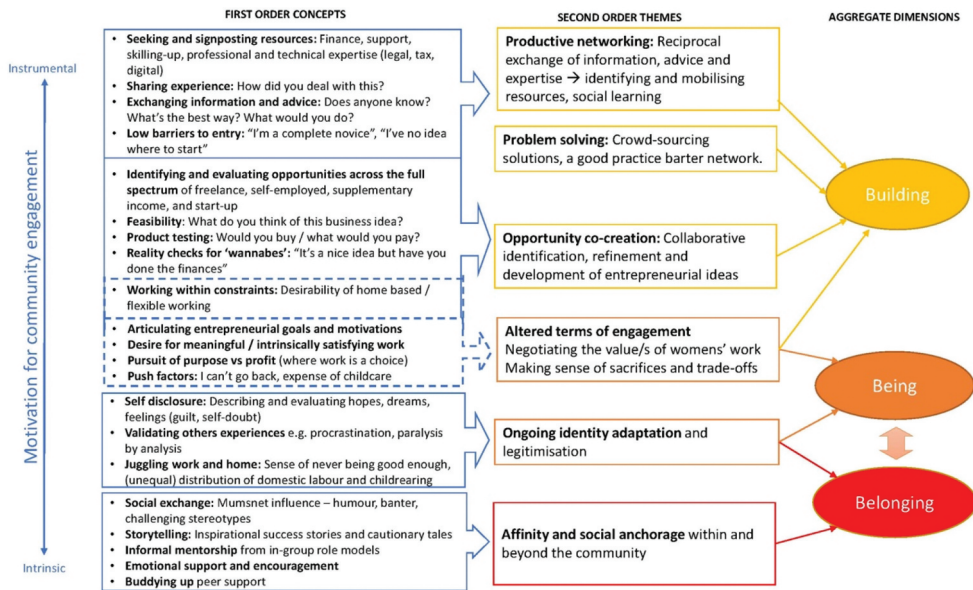
Figure 1. Data structure – women's engagement with online networks through building , being and belonging .

CoPs – the exchange of tacit knowledge, development of shared resources and practical problem solving. The Belonging dimension aligns with the importance of affiliation and social exchange within a relational network that CoP theory makes explicit. The Being dimension focusses on the importance of identity; becoming an entrepreneur whilst simultaneously being a (good) mother. In the analysis below, we attempt to present evidence that both distinguishes key dimensions of community engagement but also highlight the extent to which these dimensions overlap – as anticipated in the context of a CoP in which personal and professional development opportunities are embedded within communal action, discussion and social exchange. Selected extracts and analytical commentary highlight the linkages between multiple themes embedded in discussion threads. Where data and insights from each of the three phases of collection are combined below; we use the codes [WF] Workfest [IV] interviews and [ON] online discussion for to identify the source if not explicitly stated.