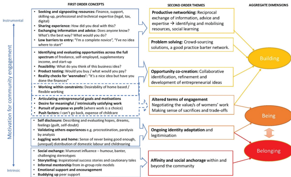
Figure 1. Data structure – women's engagement with online networks through building , being and belonging .

CoPs – the exchange of tacit knowledge, development of shared resources and practical problem solving. The Belonging dimension aligns with the importance of affiliation and social exchange within a relational network that CoP theory makes explicit. The Being dimension focusses on the importance of identity; becoming an entrepreneur whilst simultaneously being a (good) mother. In the analysis below, we attempt to present evidence that both distinguishes key dimensions of community engagement but also highlight the extent to which these dimensions overlap – as anticipated in the context of a CoP in which personal and professional development opportunities are embedded within communal action, discussion and social exchange. Selected extracts and analytical commentary highlight the linkages between multiple themes embedded in discussion threads. Where data and insights from each of the three phases of collection are combined below; we use the codes [WF] Workfest [IV] interviews and [ON] online discussion for to identify the source if not explicitly stated.