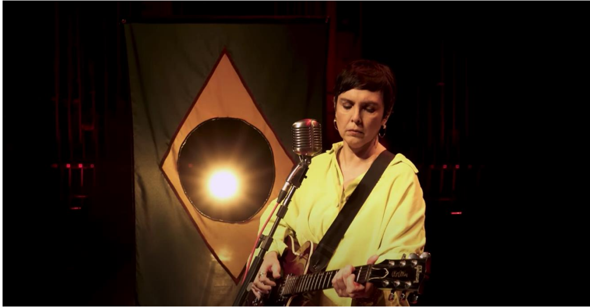
Figure 2: 2 de Junho [June 2nd] (premiered on Sept 18, 2020) by Adriana Calcanhotto (b. 1965). Available on YouTube at https://youtu.be/Myob26bhNqs .