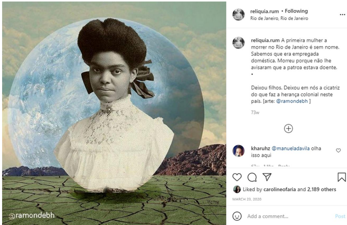
Figure 4: First post (March 23, 2020). Instagram account @reliquia.rum. Art: @ramondebh.