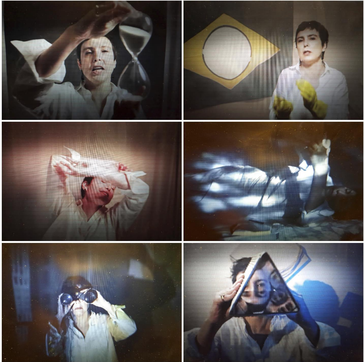
Figure 8: “Só”. O Clipão da Quarentena [“Alone”. The Big Clip of Quarantine ] (premiered on May 28, 2020) by Adriana Calcanhotto (b. 1965). Available on YouTube at https://youtu.be/1TMhfkf-ajY .