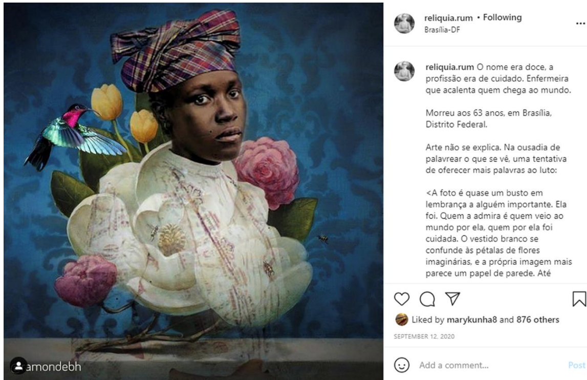
Figure 6: Post (September 1, 2020). Instagram account @reliquia.rum. Art: @ramondebh.