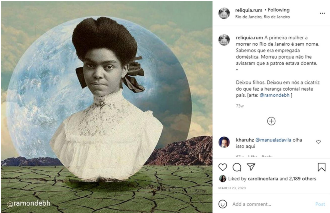
Figure 4: First post (March 23, 2020). Instagram account @reliquia.rum. Art: @ramondebh.