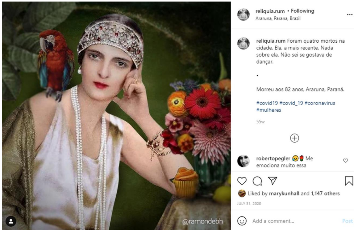
Figure 7: Post (July 31, 2020). Instagram account @reliquia.rum. Art: @ramondebh.