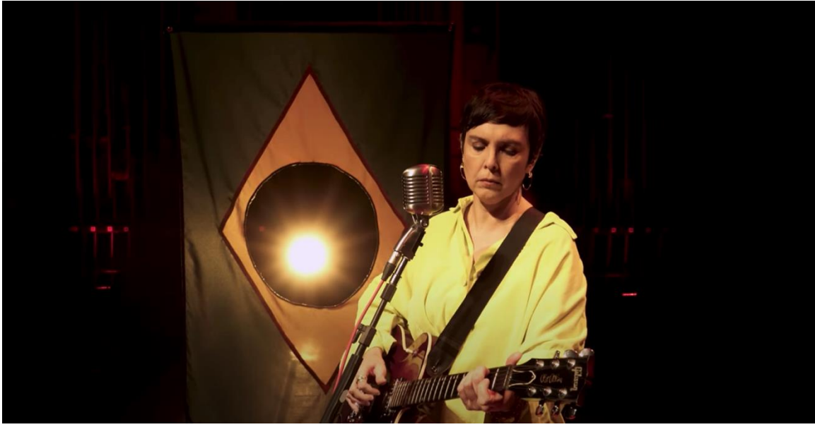
Figure 2: 2 de Junho [June 2nd] (premiered on Sept 18, 2020) by Adriana Calcanhotto (b. 1965). Available on YouTube at https://youtu.be/Myob26bhNqs .