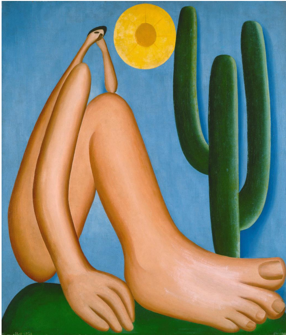
Figure 1: Abaporu (1928) by Tarsila do Amaral (1886–1973). Museo de Arte Latinoamericano de Buenos Aires [Latin American Art Museum of Buenos Aires].