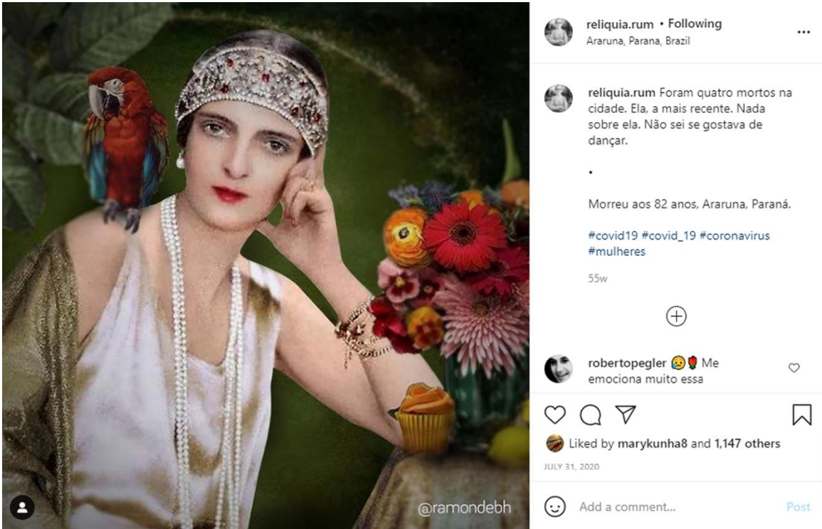
Figure 7: Post (July 31, 2020). Instagram account @reliquia.rum. Art: @ramondebh.