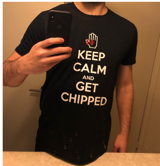
Figure 2. The first author is wearing a t-shirt of the biohacking community.

Despite the possibility of being hacked by a computer virus, and so be tricked like Zeus, biohackers trust their fellows to conceive a solution for the problem. To keep the strength and cohesion of the group, Promethean biohackers share their biohacks and goals in online communities not only to be scrutinized but also to be socially endorsed (Giger & Gaspar, 2019). As another example of this social dynamic, Figure 2 shows a picture of a Facebook post of the first author wearing a t-shirt with a unique design which stands for the community. This photo was taken after the NFC microchip implantation in his left hand.