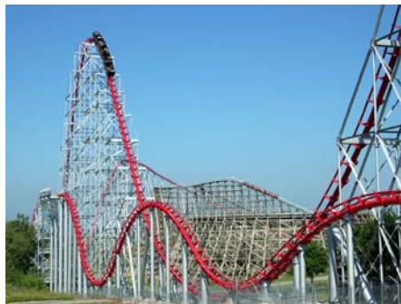
D. Roller coaster