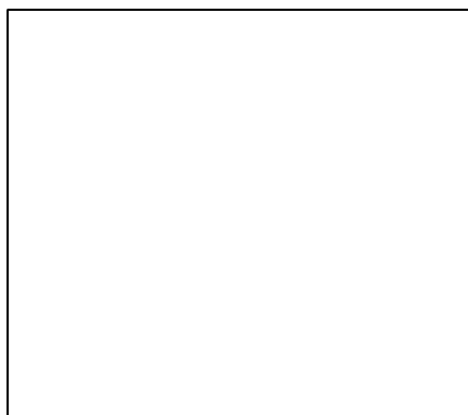
E. Draw your own picture or describe in your own words